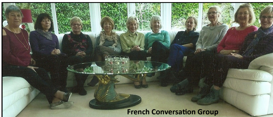
French Conversation Group