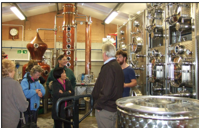
Silent Pool Distillery